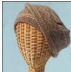
Tundra Beret – made to fold around center brown ring – or leave floppy.

WE DO NOT SELL THE YARN, PATTERNS OR RAW FIBER.