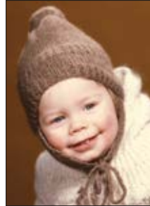
Baby Cap – with ear flaps and under-the-chin string ties. Will easily fit infants to three-year-olds.