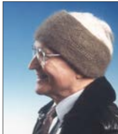
Headband from Unalakleet “Wolverine” derived from a traditional dance mask.

WE DO NOT SELL THE YARN, PATTERNS OR RAW FIBER.