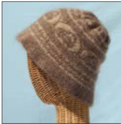
Herders Cap – bell shaped with floppy brim.