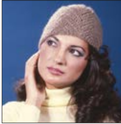
Cloche Cap – close fitting, more like a beanie-style hat.