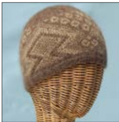
Forest Cloche – close fitting skull cap.