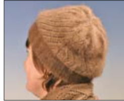
Star Cap – with cuff and full crown. Styled like a stocking, cap can be worn floppy or folded for a more stylish look.