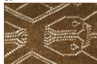
Unalakleet (Wolverine Mask)

Adapted from a dance mask used in dance ceremonies.