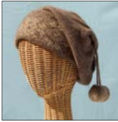
Sunburst Cap – extra floppy large top.