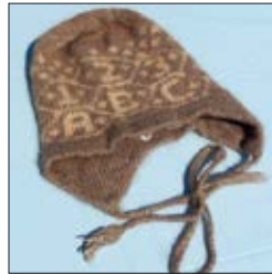
ABC Baby Cap – with ear flaps and under chin tie.