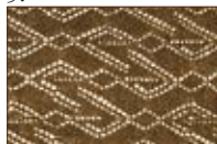
St. Marys (Dancers)

From ivory carving depicting Native dances.