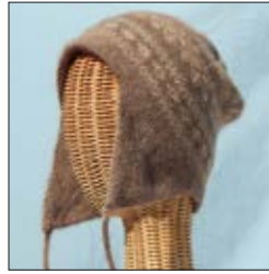
Igloo Cap – with ear flaps.