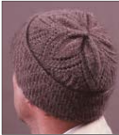
Harpoon Cap – with cuff, close fitting, more like a watchman's cap.